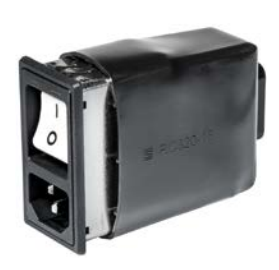
RC320 Rear Cover for Power Entry Module